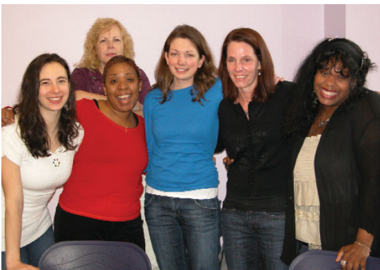
The happy graduates of WIT's spring 45-hour Domestic Violence Advocate Training class. These women now assist WIT staff in answering the LifeLine.

CORA Services Enon Tabernacle Church Mercy Hospice Housing Association of Delaware Valley Head Start Learning Tree Lincoln High School Southeast Asian Mutual Assistance Association Houston Community Center PathWays PA Liberty Resources Maternity Care Coalition Hospital of the University of Pennsylvania Family House Now