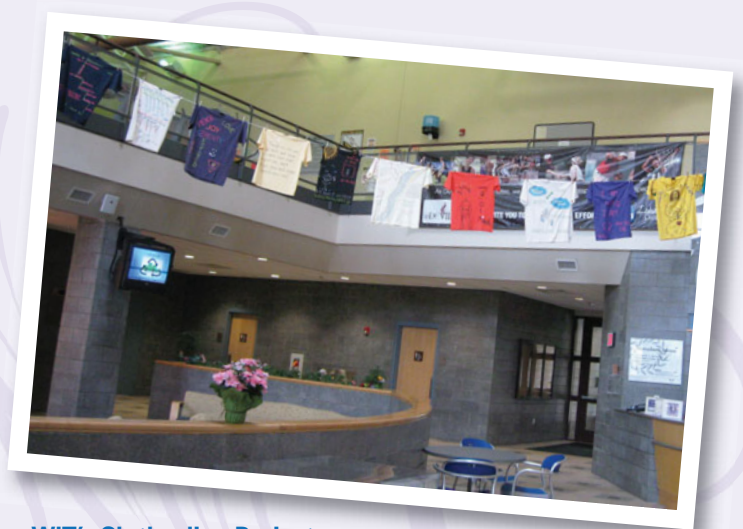
WIT's Clothesline Project displayed at University of the Sciences in Philadelphia

During the last 2 years, WIT staff have provided 196 educational programs to 11,180 community members and 65 trainings for 952 individuals including: