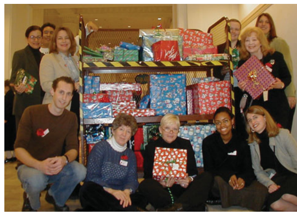
A group of Adopt-a-Family donors